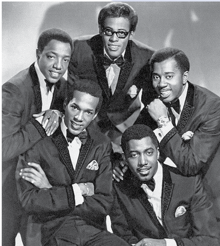
The “classic five” lineup of The Temptations. Clockwise from top: David Ruffin, Melvin Franklin, Otis Williams, Eddie Kendricks, and Paul Williams.